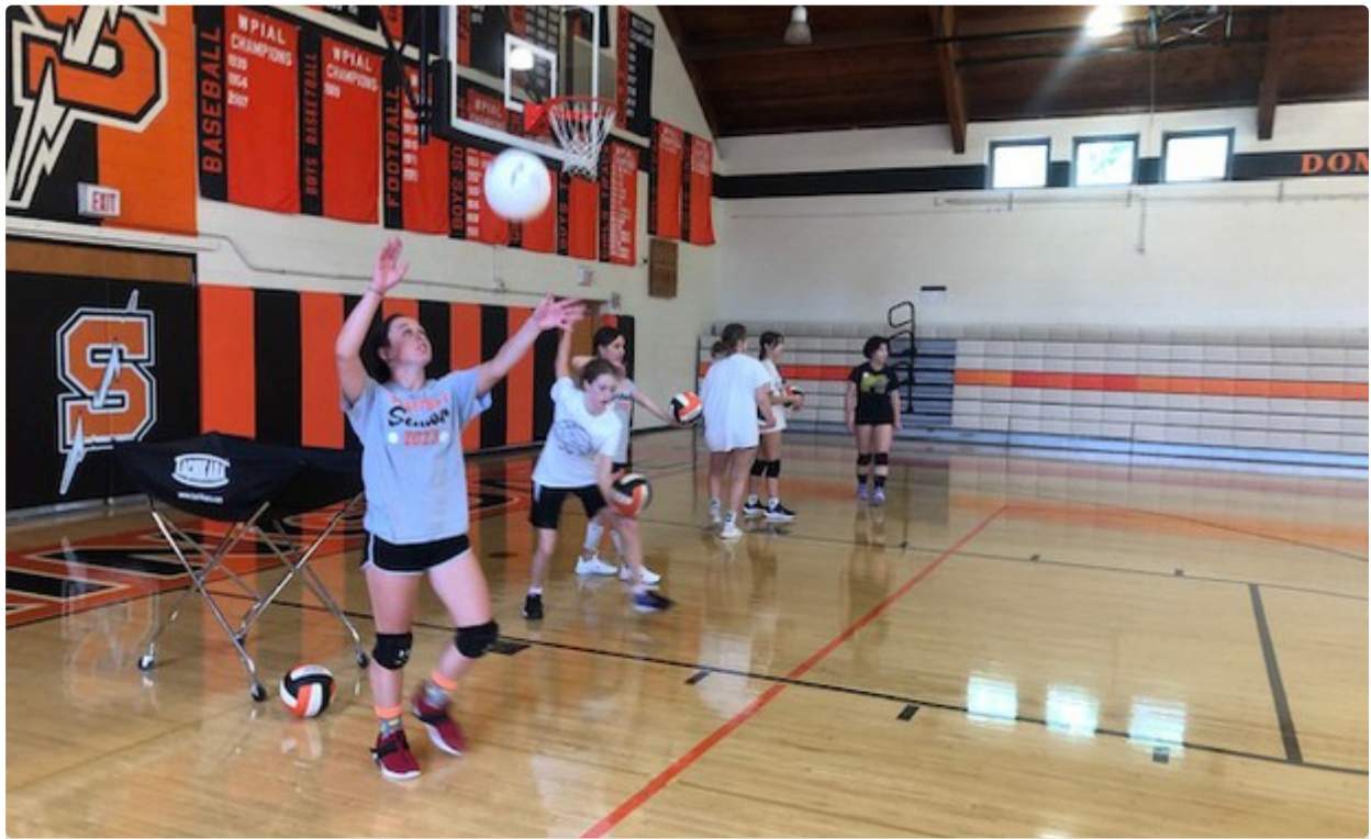
Photo: Athletic camps started on Monday, August 15 for fall sports. Students participating in football, boys' soccer, girls' soccer, volleyball, and cheerleading began practice for the 2022 season.