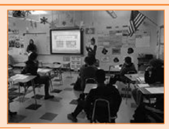
PPG Industry employees talked with Springdale High School students as part of the Junior Achievement program.

Springdale Jr-Sr High School's Art Department has a history of bringing awards back to the District. In past years, students have won honors in local, regional, and national contests. These awards show not only the detailed skills they are learning, but the dedication of our students to the arts.