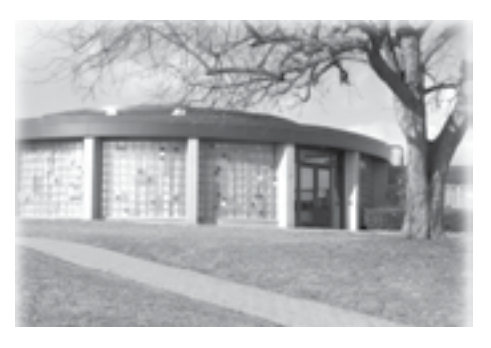
At Springdale Jr-Sr High School...administrators Shadow a Student to gain a greater understanding and impove learning...Story on page 8.