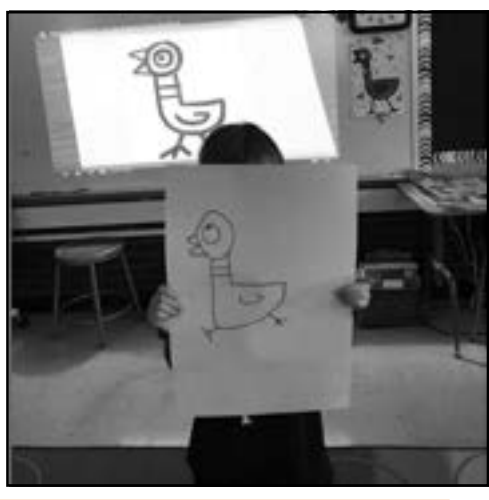
Through the SeeSaw program, students can show off what they are doing in the classroom.

Using this app, students are able to collect "learning artifacts" of their work by taking pictures, recording videos, annotating documents, and capturing audio. With teacher approval, those artifacts can then be sent to the important people at home who are connected through the SeeSaw family app,