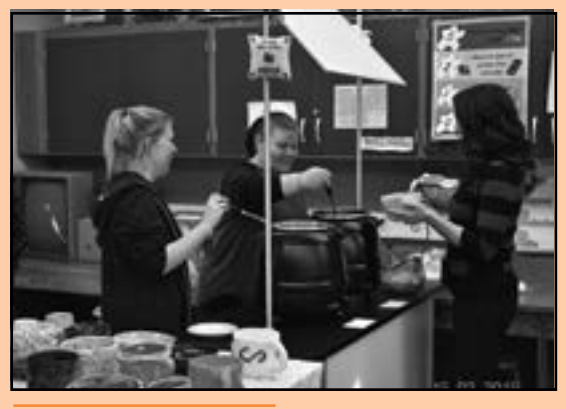
Springdale Jr-Sr High School consumer science and art students held the annual Empty Dish event to raise funds for the Lower Valley Food Bank.

With the students producing more than just bowls in their ceramics classes, the Springdale event became Empty Dish. Guests were able to choose from bowls, mugs, and dishes for their meal, and consumer science students prepared a soup and salad lunch. Staff members donated $8.00 to participate, with all proceeds going to the Lower Valley Food Bank. The event raised more than $300.