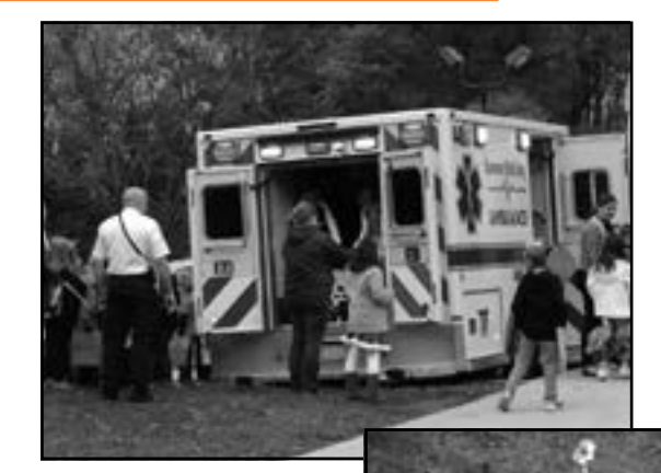
Community Emergency Agencies, staff, and students participate in the Acmetonia Primary School Safety Fair.

By state law, all school districts are required to have an Emergency Plan approved by their School Board. Every crisis incident that occurs in the District, around the state, and across the nation provides lessons to learn and implement these updates into the plan.